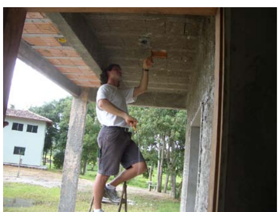
Thank you for the opportunity to represent everyone involved with FOR WE CARE.